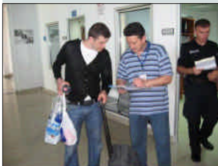
Airport assistance for the Kosovar citizen returning from the UK

IOM Kosovo, through Assisted Voluntary Returns (AVR) programmes aims to promote sustainable voluntary return and reintegration of Kosovars, returning from different countries through measures to improve economic prospects for both the returnees and members of the receiving communities. Since 1999 IOM Kosovo in coordination with different governments has developed several AVR programmes for Kosovar returnees giving a special attention to the vulnerable individuals and groups. This is done by providing specific transport in accordance with the needs, employment opportunities through referrals, on-the-job trainings, business training, the provision of micro-credits/-grants and trade-related toolkits. Included in this category are: the elderly, the handicapped, unaccompanied minors, single women travelling with children, the sick persons and ethnic minorities.