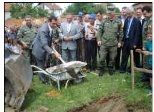
Inauguration of the work for the medical clinic in the village of Varosh/Varos Ferizaj/Uroševac Municipality

The village of Varosh/s is located in the southern end of the Municipality of Ferizaj/Uroševac and has a population of approximately 3,400 inhabitants. The closest medical facility for the people of this region is over ten kilometres away. Therefore, this project will dramatically reduce the travel time required to reach medical care, and also will raise the living standards and quality of life for the area's inhabitants.