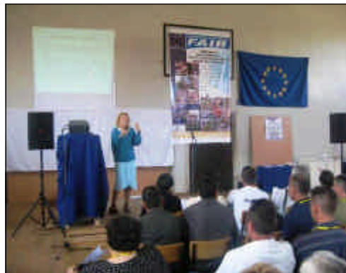
Training on advertising, branding and packaging for the FAIR participants

The main purpose of the fair, was to promote economic and community revitalization for all communities in Kosovo through an adherence to the principles of economic opportunity, sustainable development, and community-based partnerships. The fair gave an unique opportunity for the beneficiaries to share their experiences, products, services, among them and the larger community. This event brought together beneficiaries from different sectors that have the willness and potential to improve their existing micro-business, encourage market linkages among them. The assumption is that this growth/development process leads to increased levels of general welfare that would reduce the out migration and increase the resettlement of actual displaced persons.