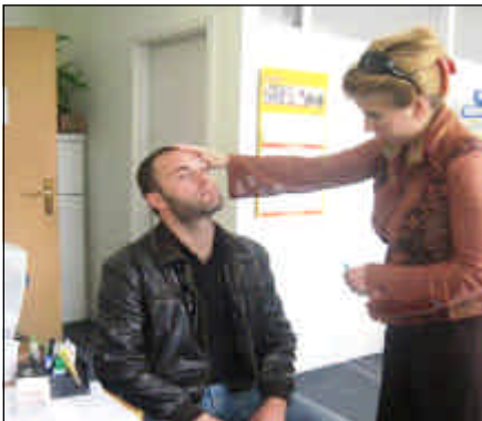
Health assessment for potential Kosovar migrant