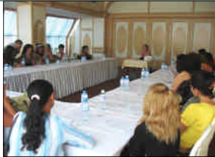
CT informative meeting with potential victims of trafficking

During the first four months of the project implementation, three partner NGOs have been chosen in the targeted areas and communities (Mitrovicë/a, Gjilan/Gnjilane and Prishtinë/Pristina), and according to the original plan of action, IOM has developed and shared general guidelines about the characteristics of the population to be targeted by the project through the partner NGOs.