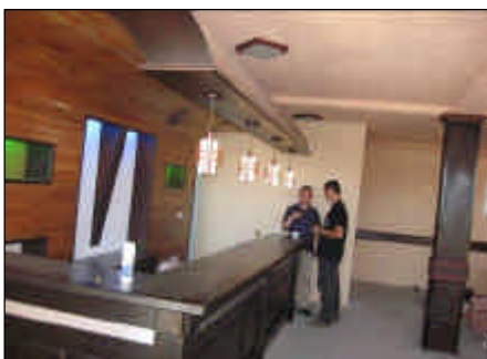
IOM VARRP supported business in the service sector-Restaurant in Ferizaj/Urosevac

Through this programme, during the period from May to August 2008, 23 persons returned and were entitled to reintegration assistance. The majority of these returnees have taken advantage of the assistance available to them and almost all have been counselled. The main areas of returnees' income generating projects have continued to be: on the job training supported through salary subsidies, jobs in the service sector and agriculture as well as activities related to construction. During above mentioned period, 22 individuals have benefited directly and 26 indirectly from the 11 projects supported by the VARRP reintegration fund.