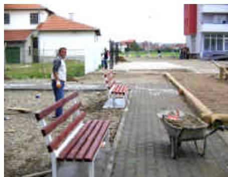
Construction work at Roma Mahalla in Mitrovicë/ Mitrovica