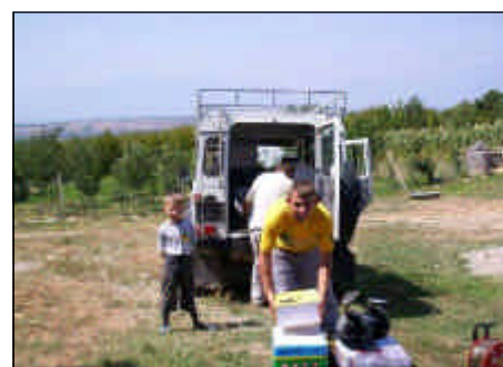
UAFM beneficiary with purchased equipments

During the period from May to August 2008, 77 family tracing interviews with family members have been conducted in different villages/municipalities within Kosovo in close cooperation with the social workers from respective municipal Centres for social work.