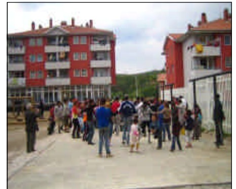
Inhabitants of the Roma Mahalla quarter celebrating the completion of the project

The Roma Mahalla is located in southern part of Mitrovica, but was destroyed during the conflict in 1999. Some of the families were displaced to camps in Northern Kosovo, while others were displaced to Serbia, Montenegro and Western Europe. In March 2007 RAE population began the return to Roma Mahalla. Despite the reconstruction of houses, buildings, a cultural centre, a health centre, a playground and other premises, the Roma Mahalla residential area was a "dead" zone with no green areas trees or grass, no demarked paths or benches and trash is spread in the streets. There was a playground for kids to play and youngsters to play sports, but no space for people to sit down and communicate.