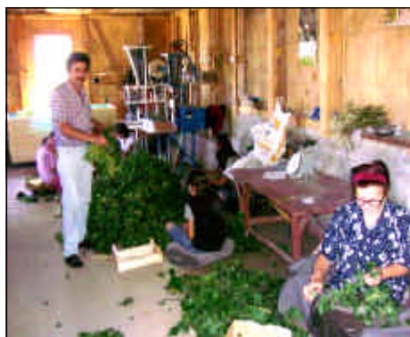
Drying of curative plants and tea packaging project