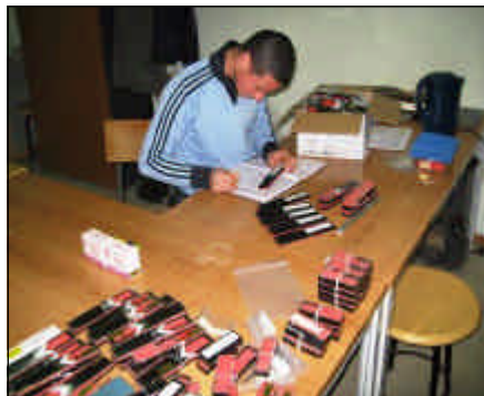
Donation of Swedish Government of the Microsurgical ophthalmologic instruments for the University Clinical Centre in Kosovo

During the last eight years, health assessment assistance has been offered to Kosovars immigrating to Australia, Canada, USA, And New Zealand. In the period from May through August 2008, health assessments were provided for 351 applicants.