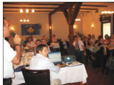
Workshop for finalization of the Kosovo Plan of Action on CT

IOM in cooperation with National Coordinator for Counter Trafficking organized the workshop for the finalization of the Strategy and KAP for Counter Trafficking. The one day workshop took place on 29 July 2008, in Prishtinë/Priština, with participation of 43 CT actors. The Strategy and the KAP is finalized in three languages, Albanian, Serbian and English, and its printing is in the process.