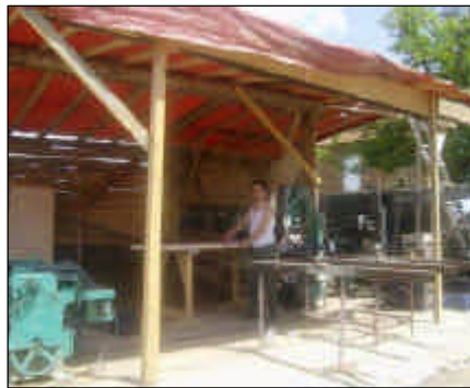
REAB beneficiary supported with expansion of wood-processing business in in Glllogoc/Glogovac Municipality