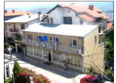
IOM Main Office in Arbëri II (Dragodan Hill) Prishtinë/Prishtina

Mailing address: International Organization for Migration Mission in Kosovo Street: Ismail Qemali 18 Arbëri II, Prishtinë/Prishtina Phone+381 38 249-058/059 Fax:+381 38 249 039 E-mail: iomprn@iom.int