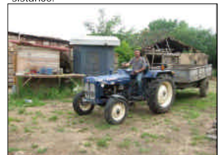
RAS Programme supported an agriculture business in Viti/Vitina municipality

Returns Assistance Switzerland (RAS) service is a part of the continuous support that the Swiss Government extends to those who are voluntarily returning to their communities of origin in Kosovo. The assistance provided has generally included: support for education, the purchase of medications, housing equipment, financial resettlement assistance and toolkits for those initiating or expanding small businesses. These services are extended to those who return voluntarily from Switzerland to their communities of origin. In 2008, 15 individuals (14 cases) or during the returned under this programme and received various forms of reintegration assistance.