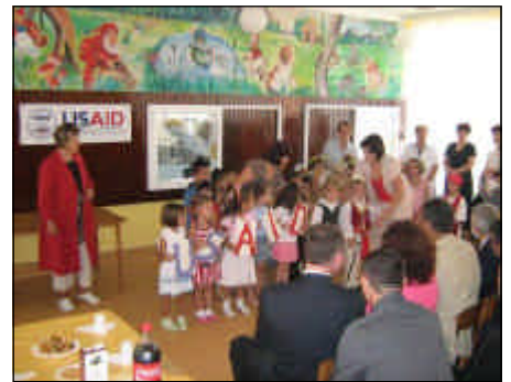
Children celebrating a completion of the renovation of their kindergarten

and disposed of, as there are concerns that lead from the Trepca complex may have contaminated the soil. This, as well as the removal of the roofing materials, was coordinated with the municipal environment department who ensured that the waste materials were disposed according to Kosovo's environmental guidelines.