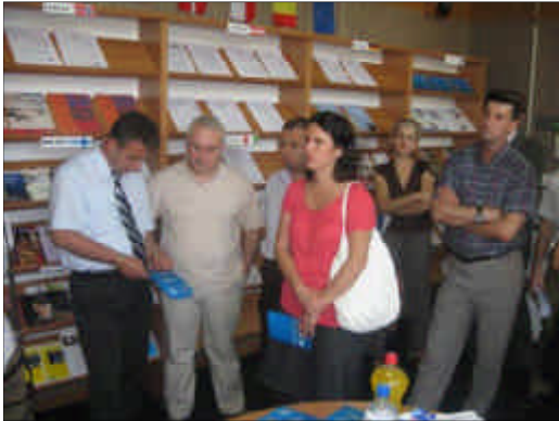
Newly opened Migrant Service Centre in Prishtinë/Prishtina