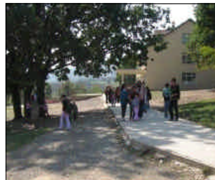
Educational assistance for the VoTs crucial for the reintegration efforts

During this period IOM continued cooperation with KFOR CIMIC Section and Kosovo Police Service (KPS) to deliver presentations for KFOR and Kosovo Police School in Vushtrri/Vucitrn for 'Advanced Investigation Trainings' and 'Trafficking in Human Beings' regular sessions.