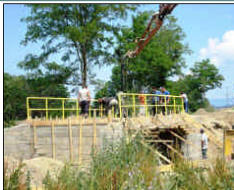
Construction of bridge in Bajčinë/Bajcine in Podujevë/Podujevo Municipality

In nearly continuous implementation since July 2000, the International Organization for Migration's (IOM) Trust Fund (TF) Programme funded by the governments of Great Britain and Northern Ireland, the Netherlands and Denmark, productively engages members of the Kosovo Protection Corps in civic and humanitarian work projects, which contribute to the reconstruction of Kosovo's infrastructure for all communities. Furthermore, since many of the projects have benefited ethnically mixed and ethnic minority communities in identified return areas, the KPC's participation in the Trust Fund has contributed to increas-